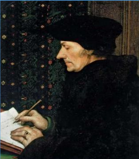
E. Rotterdamský Autor: Hans Holbein Jr.